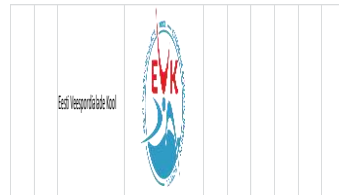
FIGURE DETAILED RESULTS - AGE GROUP 13-15