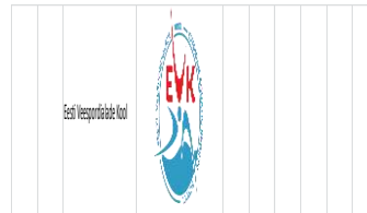
FIGURE DETAILED RESULTS - AGE GROUP 12 AND UNDER